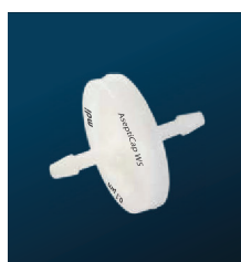
AseptiCap ® WL/WS 25mm, 5cm 2

mdi provides complete documentation for each of the AseptiCap ® WL/WS filters there by reducing the additional validation cost and time.