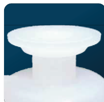
1 1/2" Sanitary Flange