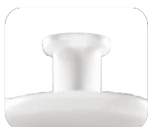
3/4" Sanitary Flange