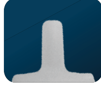
Male Luer Slip