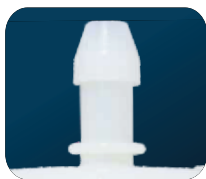
1/2" Single Stepped Hose Barb