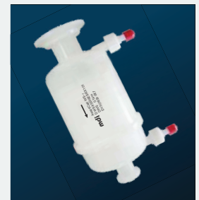
1 1/2" Sanitary Flange to 3/4" Sanitary Flange