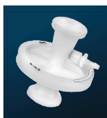
AseptiCap ® WL/WS 50mm, 20cm 2