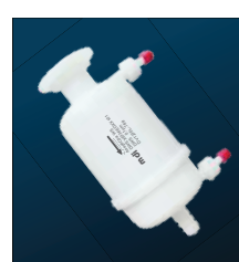
AseptiCap ® WL/WS 5", 1000cm 2