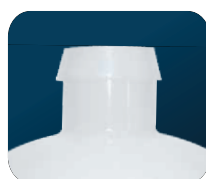
1" Hose Barb