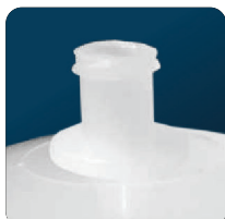
Female Luer Lock