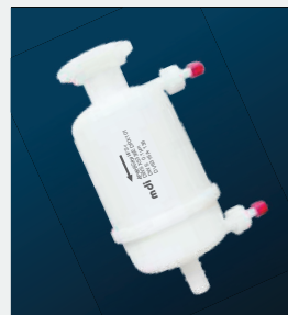
1 1/2" Sanitary Flange to 1/2" Barb Hose

mdi AseptiCap® WL/WS filters are available in a wide range of end connections and are also customized to offer different inlet-outlet combinations to meet the unique connectivity needs in biopharmaceutical process assemblies where, for example, stainless steel components with sanitary flange connections are sometimes required to be connected to single use disposable systems through quick-connectors or hose barb connections.