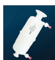
AseptiCap ® WL/WS 8", 2000cm 2