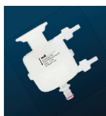
AseptiCap ® WL/WS 2", 500cm 2