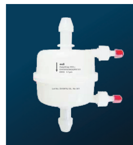
AseptiCap® with HighSecurity 1/2" hose barb connection