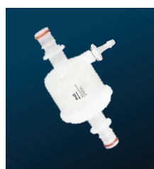
AseptiCap ® WL/WS 1", 250cm 2